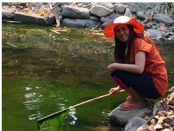
Figure 1. Traditional harvesting method

samples were dried in continuous air flow (35 °C, 72 h). The dried alga was then milled in a mechanical grinder for 5 min to obtain a fine and homogeneous powder. The powder was stored in hermetic bags in a dry and dark area at room temperature (25 °C) until use.