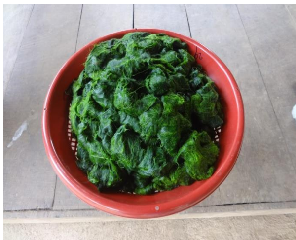
Figure 2. Harvested Macroalgae sample