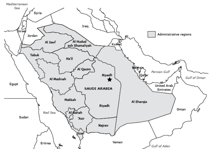
Figure 1. Thirteen administrative health regions, Kingdom of Saudi Arabia.

The Saudi Health Information Survey (SHIS) was a national multistage survey of men and women aged 15 years or older. Households of Saudi citizens were randomly selected from a national sampling frame maintained and updated by the KSA Census Bureau. The Ministry of Health divides KSA into 13 health regions, each with its own health department (Figure 1). For the survey, we divided each region into subregions and blocks used by the KSA department of statistics. All regions were included in the survey, and a probability proportional to size was used to randomly select subregions and blocks. Households were randomly selected from each block. A roster of household members was created, and an adult aged 15 or older was randomly selected from that household to be surveyed. If the randomly selected adult was not present, our surveyors made an appointment to return, and a total of 3 visits were made before the household was considered as a nonresponse. Weight, height, and blood pressure of the randomly selected adult were measured at the household by a trained professional.