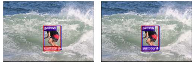
Figure 4: Two scenes from MSCOCO15 (best viewed in color). In each scene, the left image contains the output of the baseline method FRCNN, whereas the right image contains the output of our proposed KG-CNet. Ground-truth objects are marked with orange boxes, and correct detections of IoU at least 0.75 in top 100 are marked with blue boxes.