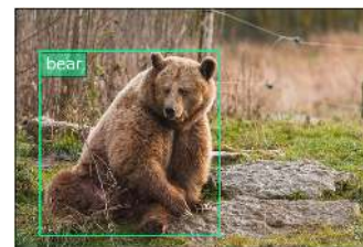
Figure 1: Object detection on images from MSCOCO15.

Recent advances in deep convolutional neural networks [Sermanet et al. , 2013; Girshick et al. , 2014], in particular Fast or Faster R-CNN [Girshick, 2015; Ren et al. , 2015], show great promise in object detection. However, like previous approaches, these methods only account for patterns present in the training images, without leveraging much of the knowledge an average person would have. For example, humans have the common sense or implicit knowledge that a domestic cat sometimes sits on a table, but a bear does not barring very rare circumstances. This background knowledge would naturally help reinforce the simultaneous detections of cat and table (e.g. in Figure 1a), even if none of the training images portrays a cat together with a table. On the other hand, if an image is predicted to contain both bear and table, which conflicts with our background knowledge, the detections are more prone to be false.