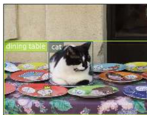
(a) Detecting cat and table