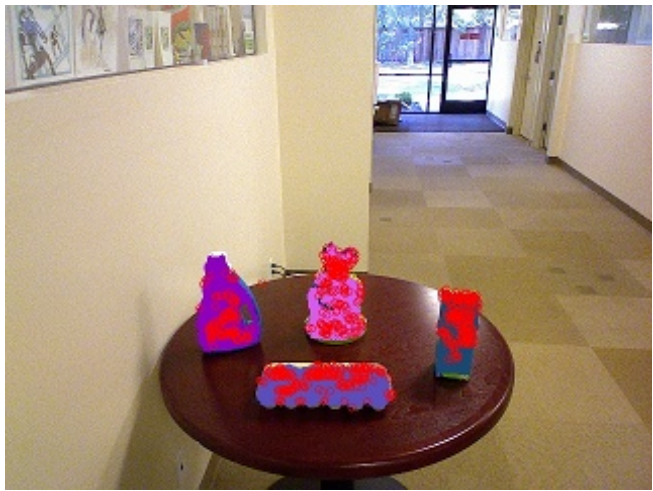
(d) The segments (false color). Seed points are drawn here as well.