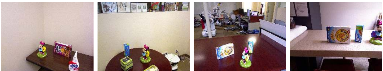
(a) The first of the four places investigated. (b) The second of the four places investigated. (c) The third of the four places investigated. (d) The fourth of the four places investigated.