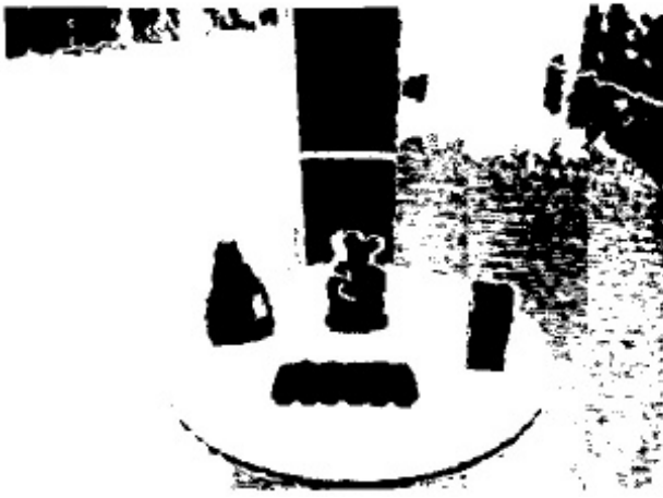
(c) The planes-and-edges mask. White indicates areas that will be masked out of the image. Flood fill occurs within the black areas.