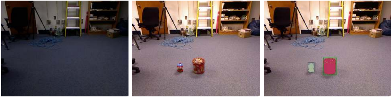
(a) An image from before the objects appear. (b) An image when the objects are visible. (c) An image with the segmentations drawn on.