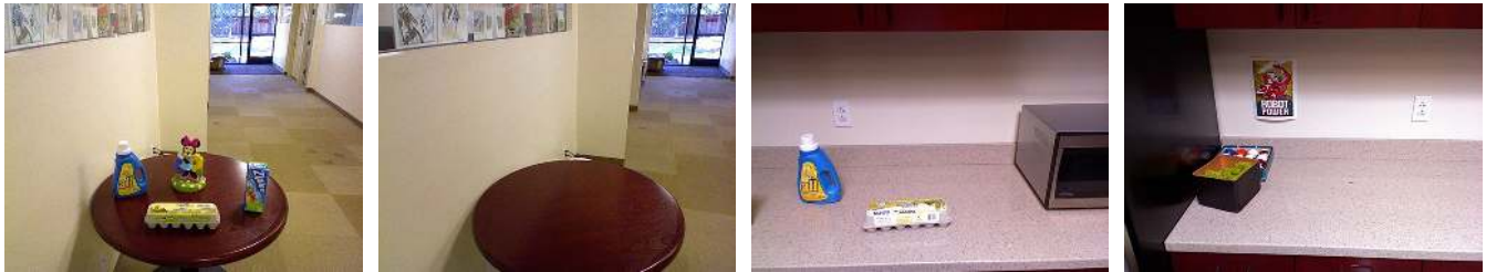
(a) An example observation of the table, with objects. (b) An example observation of the table, without objects. (c) An example observation of the counter, with objects. (d) An example observation of the counter, without objects. (The objects seen here are never seen to move, and so are not detected by our system.)