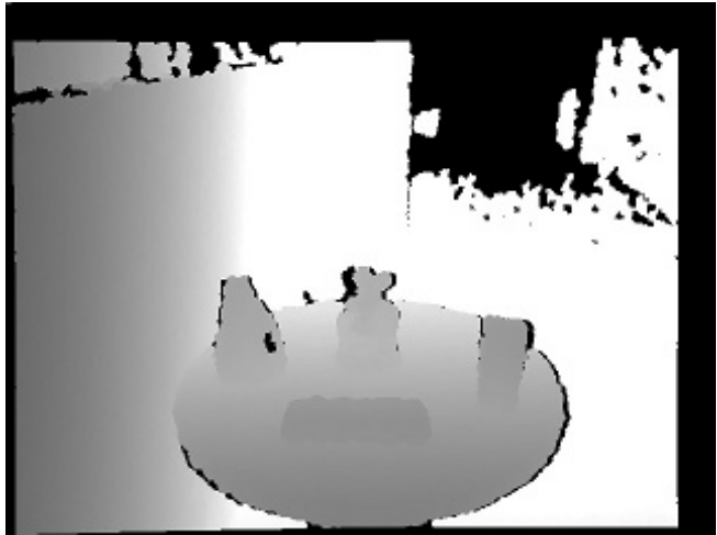
(b) The depth image, scaled so that 2 m fills the range (per our depth cutoff; see Section IX).