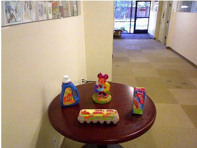
(a) The RGB image. The projected feature clusters (used to seed the flood-filling operation) are drawn on in red.