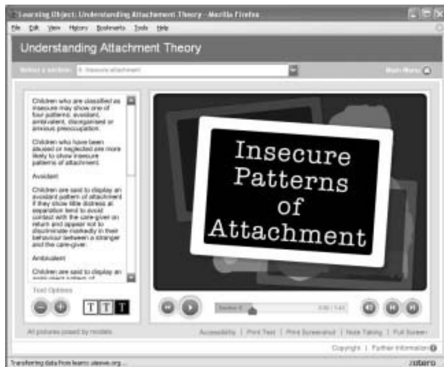
FIGURE 2. The Flash Template for the Multimedia Learning Objects

At the same time as developing the learning object repository, developing multimedia content, and repurposing other material, project staff