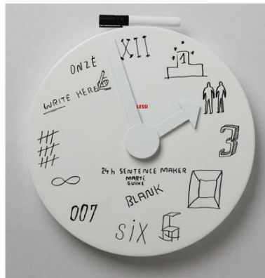
Figure 5 Blank Wall Clock by Martí Guixé/Alessi (see online version for colours)