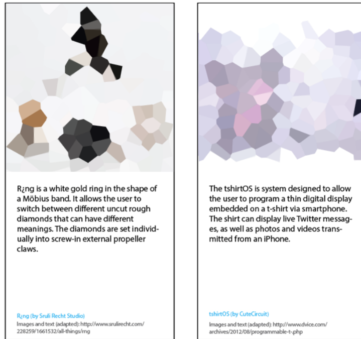
Figure 1 Examples of stimuli cards used in the study (see online version for colours)

Note: The images are pixelated for copyright purposes.