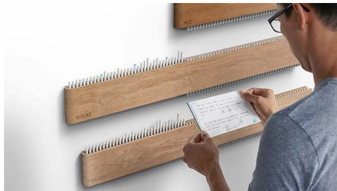
Figure 3 OWL – on the wisdom of life by Designs on/IDEO (see online version for colours)

Note: Image courtesy of IDEO, reprinted with permission.