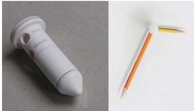
Figure 12 The Meaning of Time by Bomi Kim (see online version for colours)

An example of a product that allows shared transformation by giving room for people’s input at an aesthetic and functional level is the Meaning of Time by designer Bomi Kim (Figure 12). It is a clock mechanism without hands, which invites a person to insert a tangible element to complete the object, involving him/her in the aesthetic and functional outcome of the object. Participants in the study acknowledged the possibilities of this design strategy by discussing the product example in the following way: “The user has significant influence on how the object ends up looking or behaving. The product wouldn’t function without input. It’s Do It Yourself” (DRP03). “Unfinished product enables or supports your own creation. It enables expression. It has the goal of motivating a user to be more creative” (DRP01).