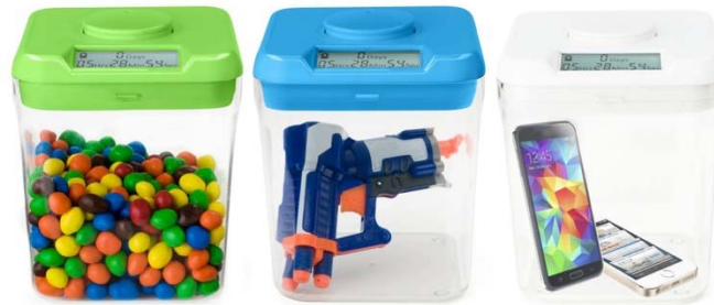
Figure 6 Kitchen Safe by kSafe (see online version for colours)

cutting back on smoking. Study participants discussed the potential of this design direction through this product: “This is about designing something to teach people the value of patience and self-control” (DP04). “In the long term it helps build intrinsic motivation” (DRP01). “The strategy is to create a barrier. It creates symbolic meaning by motivating the person to stick to an important goal, it is done by eliminating whatever stands in the way of that goal. Eliminating the obstacles by creating a barrier. The designer can question: what are the obstacles, and how can I help eliminate them” (DRP03).