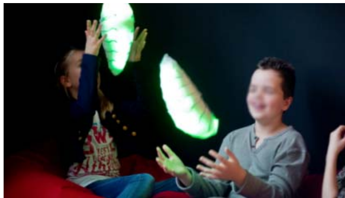
Figure 11 Liv by TU Delft/Interactive Environments (see online version for colours)