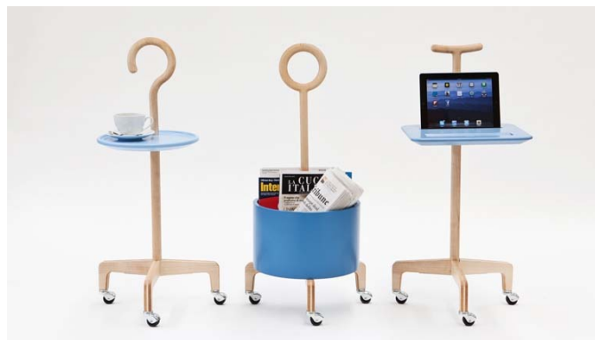
Figure 9 No Country for Old Men/Together Canes by Lanzavecchia + Wai (see online version for colours)

An example of a collection of products that aims to destigmatise by enhancing the aesthetic qualities of physically enabling products is the No Country for Old Men/Together Canes by designers Francesca Lanzavecchia and Hunn Wai (Lanzavecchia + Wai) (Figure 9). This collection of canes is described as 'walking aids for living, not just mobility', which suggests that in addition to providing physical support, the products were designed to accommodate modern living, such as using mobile devices. Study participants recognised the potential of the design direction by discussing this product in the following way: "This is really about making an object-based stigma into a beautiful intervention" (DP02). "It empowers you to feel like you are in control" (DRP01).