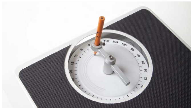
Figure 4 The weight recorder by Weiche Design Works (see online version for colours)