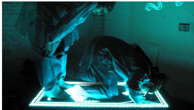
Figure 2 EL Sajjadah by SOPDS (see online version for colours)

A product that provides guidance and simplifies or provides easier access to group or community activities can encourage a person to cultivate such meaningful affiliations and is thus conducive to gaining a symbolic meaning related to those positive relations, provided that the activity the product facilitates and the group it represents are of emotional relevance to the person.