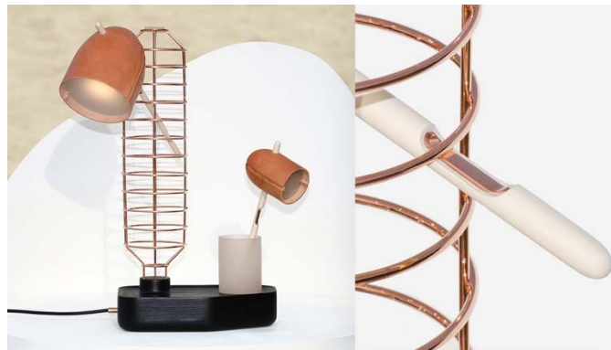
Figure 10 The Standard Lamp by Knauf and Brown (see online version for colours)

agency and autonomy are evidenced because the processes that make the lamp function are not automatic, and the person has to intentionally perform them. The result is that the person builds a thoughtful relationship with the product, actively making decisions that usually would not be necessary, which fosters mindful and attuned living. This relates to autonomy because it contributes to a sense of self-reliance in the user by enabling them to understand the process and intervene in any part of it. Previous research has recognised the slowing down or disclosing of processes behind products as a way to ritualise product use, which results in added value and an improved experience (Fuad-Luke, 2010). In turn, this approach contributes to delaying gratification, which is a valuable aspect of well-being (Doerr and Baumeister, 2010; Ryff, 1989). Participants from the study identified the potential of this design strategy through the discussion of the Standard Lamp's features and effects: "It's about designing something to help people reflect on everyday given things, objects, actions; to challenge people on actions that they would otherwise perform without thinking, by increasing effort" (DP04). "It's about challenging assumptions, how you think of your mindset, your attitude, so it triggers something" (DRP03).