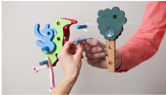
Figure 8 KonneKt by Job Jansweijer (see online version for colours)

attached to a window using suction cups (for individual play) or magnets (for group play) (Figure 8). It enables children to play games with their peers, using the very windows that physically divide and isolate them – usually seen as a limitation – as a playground. The given example is, of course, relevant for the specific context for which it was designed; however, designers can consider a similar strategy for different contexts. Participants in the study recognised the opportunities in this design direction by commenting on KonneKt’s interesting elements: “These children have the motive for sharing and playing, and this product actually helps them under these challenging circumstances to do that, to actualize that value” (DRP03). “This product is enabling interaction between two users that cannot interact directly” (DP02).