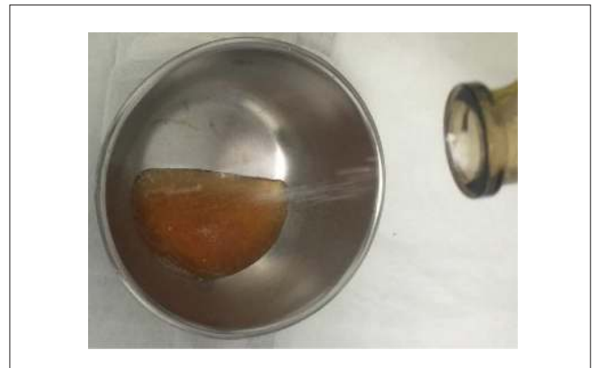
Figure 5 - Slow application of bone graft.