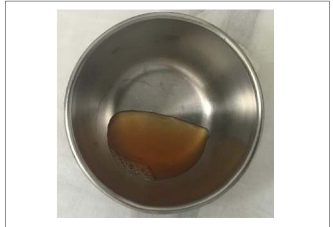
Figure 4 - i-PRF dispensed in the metal tank.

tubes with clot activators commonly used for the analysis of blood chemistry and in making the PRF 8 . Prior to completion of the technique, tests were conducted with this tube, which contains silica in its walls (clot activator), its presence having been already analyzed, showing no