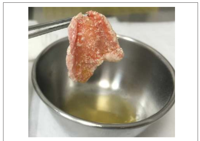
Figure 6 - i-PRF polymerized with the bone graft.