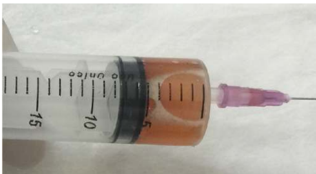
Figure 3 - Five milliliters of i-PRF obtained after collecting from the tubes.

minutes, it is possible to observe the start of polymerization, the material being ready for use in total time of 20 minutes, and can be removed to perform the bone grafting (Figure 6).