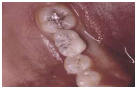
Fig. 3: The first molar crown is then evaluated with heavy bite force. The occlusal contacts ideally should be similar to the teeth under a heavy load.