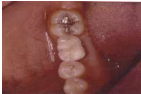
Fig. 2: A light occlusal force is applied first to the implant and teeth. The first molar implant crown has less initial contact than the teeth.