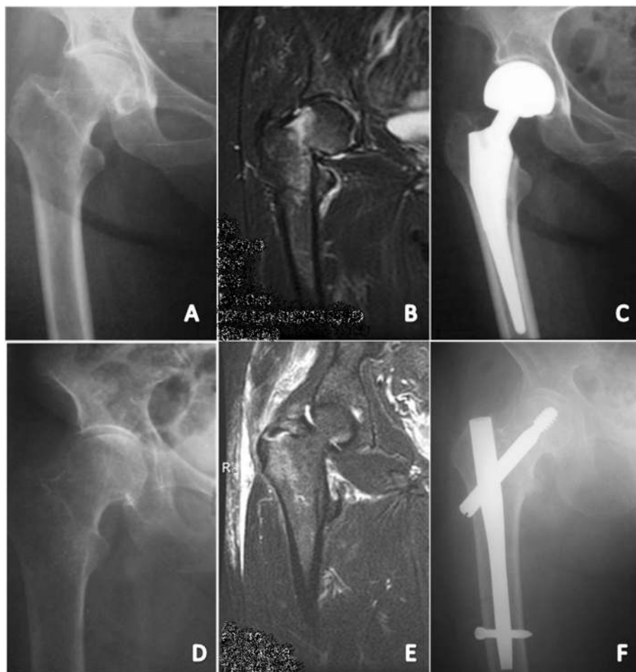
Fig. 3 a X-Ray of occult femoral neck fracture of the right hip. b MRI of the same case showing a Garden II femoral neck fracture. c Postoperative X-ray showing a uncemented bipolar hip. d X-Ray of occult petrochanteric fracture of the right hip. e MRI of the same case showing an incomplete petrochanteric fracture (>50 %). f Postoperative X-ray showing osteosynthesis with a Gamma 3 nail (Stryker, NJ)