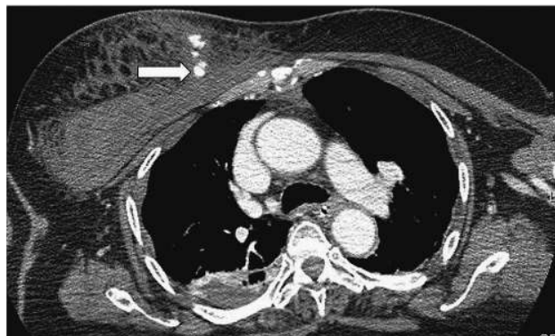
Fig. 1 A contrast-enhanced CT scan showing a massive hematoma in the right breast with contrast extravasation (arrow).

Case presentation. A 62-year-old man with no significant medical history was transferred to our emergency department presenting with hemorrhagic shock after being run over by a car. Chest X-ray and FAST excluded cavitory hemorrhage or pericardial effusion. A pelvic X-ray showed the unstable type of pelvic fracture. The patient was resuscitated with blood transfusions. Contrast-enhanced CT scans revealed multiple transverse process fractures of the lumbar vertebrae with a massive psoas hematoma, as well as a pelvic retroperitoneum hematoma related to the unstable pelvic fracture (Fig. 2). Immediate angiography detected multiple contrast extravasations in the retroperitoneum. The affected lumbar arteries and internal iliac artery were embolized, which successfully resolved his hem-