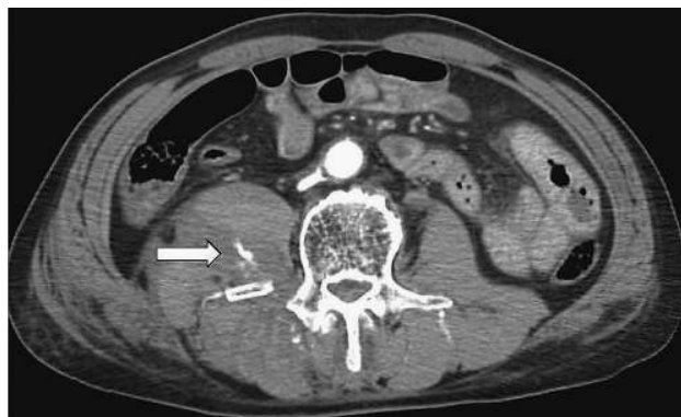
Fig. 2 Contrast extravasation and a massive psoas hematoma associated with a transverse process fracture of the lumbar vertebra (arrow).