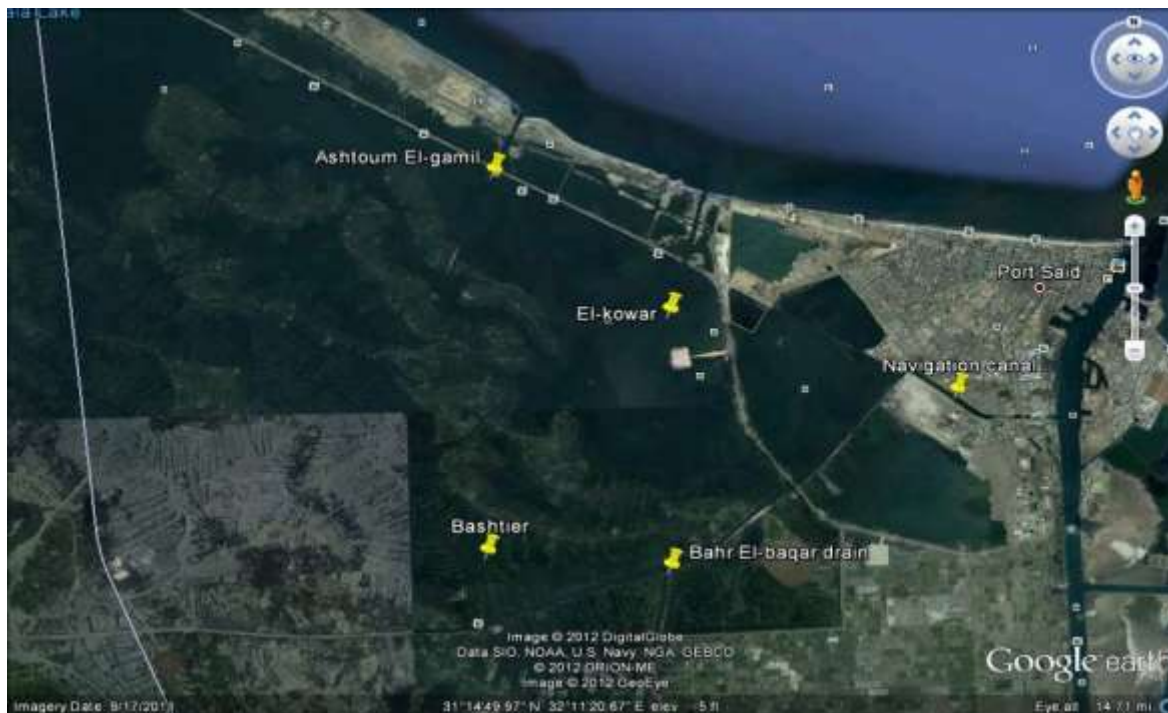
Fig. 1 – Sampling sites within Lake Manzala.