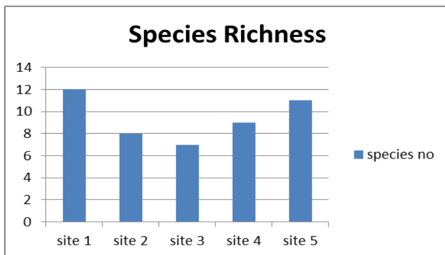
Fig. 3 – Species richness among all sites.

The greatest colony count was attributed to Aspergillus niger (31.9 % of the total isolate number) followed by A. flavus (27.3%), A. terreus (9.6%), Penicillium chrysogenum (3.7%), A. fumigatus (3.12%), A. ochraceus (2.9 %) and Trichoderma viride (2.6%) respectively. The greatest total colony count was attributed to genera Aspergillus (76%) followed by Penicillium (6%) and Trichoderma (3.2%).