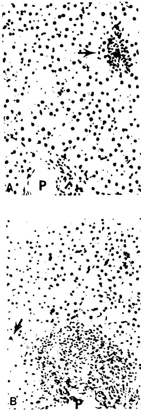
Fig 2 CMV is independent of the amount of rejection. A) The portal area (P) shows complete absence of inflammatory cells. A lobular microabscess surrounds a virally infected cell (arrow) (H/E \times 120 ). B) Expanded and infiltrated portal area (P) characteristic of rejection is present in this biopsy, in which virally transformed cells are visible in the lobule (arrow) (H/E \times 114 ).