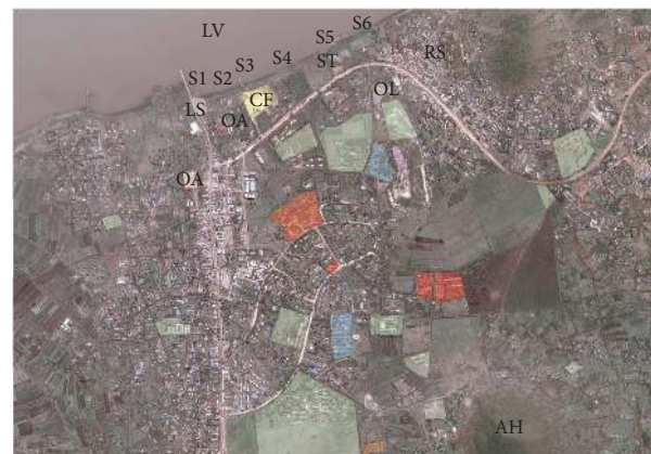
FIGURE 2: Satellite image showing the distribution of the sampling points [35]. *S: sampling sites, LS: landing site/Jetty, OA: open air market, CF: Capital fish factory, ST: sewage treatment plant, OL: old water treatment works, AH: Asego Hill, LV: Lake Victoria, and RS: residential sites.

from the surface of the water at a depth of about 50 cm from each of the sampling points. The sampling was carried out for a six-month period, from October 2011 to April 2012 with the period being dichotomised as rainy or dry season. Sampling months of October 2011, November 2011, and April 2012 were rainy months, while January, February, and March 2012 were all dry months. December 2012 was not included as a sampling month so as to balance the number of