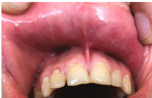
FIGURE 3: The mucous membrane of the lip with resolution of aphthous ulcers.

of adhesive films were performed in the clinic by the treating clinician, and later, it was applied by the patient at home. The patient was trained on how to use these films. The films were applied twice daily until the ulcers healed. In this reported case, aphthous ulcers in the mucous membrane cleared up within two weeks (Figure 3). The patient will be followed up by the general medical practitioner for monitoring any systemic conditions.