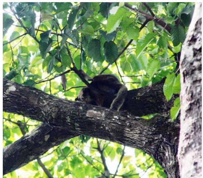
Fig. 1. Observed red giant flying squirrel ( Petaurista petaurista ) on a bough of a Dipterocarpus sp. at the Idgarh Reserve Forest in Cox's Bazar, Bangladesh.

tion is 21°32'59.40" N and 92°07'24.35" E. There are human settlements at the periphery of the forest where the squirrel was spotted. The major tree species of the forested areas are: Swintonia floribunda Griff., Brownlowia elata Roxb., Dipterocarpus spp., Tetrameles nudiflora R.Br., Artocarpus chama Roxb., Aphanamixis polystachya Wall, Hopea odorata Roxb., Lagerstroemia spp., Syzygium spp., Magnifera longipes Griff., Ficus spp. and Gmelina arborea Roxb. ex Sm.