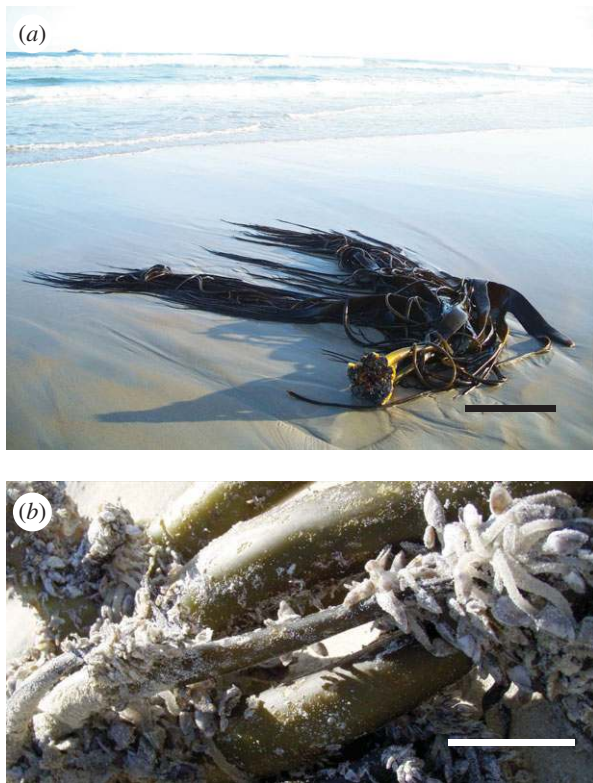
Figure 1. Bull kelp wrack at St Clair Beach, New Zealand. (a) Photograph of a detached, beach-cast bull kelp specimen at St Clair Beach in March 2009 (not one of the rafts that formed the focus of this study). Bull kelp specimens are frequently deposited on St Clair Beach in southeastern New Zealand, but generally show no signs of lengthy oceanic drifting. For example, this specimen is estimated to have spent only a short period adrift, owing to complete absence of goose barnacles ( Lepas sp.) that rapidly colonize buoyant objects at sea. (b) One of the six bull kelp wrack specimens of subantarctic origin. Encrustations of Lepas sp. of various sizes are visible on the holdfast and stipes of the bull kelp. (Photograph taken at St Clair Beach on 26 February 2009.) Scale bars, (a) 500 mm and (b) 50 mm.

invertebrates were removed using forceps and preserved in 95 per cent ethanol.