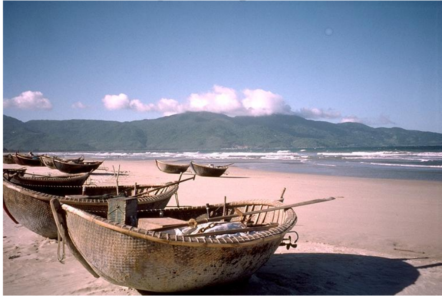
Bamboo basket boats, Vietnam, 2000. Traditionally caulked with resin and fillers such as sawdust, shredded bamboo or cattle dung.

Let us take as another example the case of cowry shells. Although the species of cowries used for money ( Cypraea moneta ) was widely distributed through the Indo-Pacific area, the best come from the Maldives, and it was the commercial production here (breeding shells on palm fronds and other leaf matter lying in shallow water) that supplied Cypraea moneta for most of the world's trade until the eighteenth century. The tentacles of these operations were far-reaching; in Yunnan a cowry-based system of exchange for paying taxes, buying land, and making donations was well established by the ninth century CE and continued until the seventeenth century (Yang 2004). Another area where cowries were much used was northern Thailand, with local rulings that were often very precise: for example, one law code specifies that if an officer "grasps the breasts of a woman who is willing" he should be fined 22,000 cowrie shells, but (to our mind, paradoxically) only half the amount if he puts his hands inside her blouse (Wichienkeo and Wijeyewardene 1986, pp. 22, 29). It seems that these networks linking Bengal and coastal Southeast Asia only declined with the expansion of Han control into Yunnan and an expanding globalized market based on coinage.