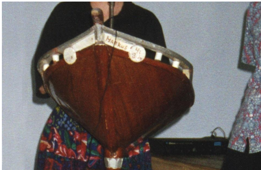
Pulpit at a church in Desa Mala, Sangihe, Indonesia, 1999.