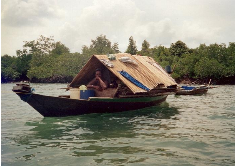
Orang Laut houseboat, Riau Archipelago 1991.