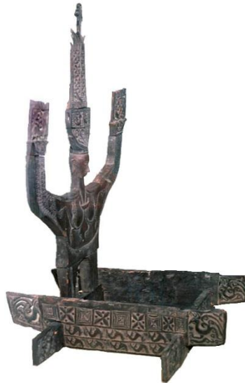
Luli carving, Indonesia.

against a tree rising out of a boat, which in turn calls up associations between male-female unity and the womb itself. In combination, the boat, tree and ancestress become a forceful image of fecundity and new birth (de Jonge and van Dijk 1995, pp. 54-55).