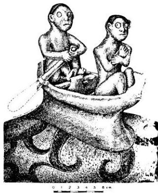
Cover of burial jar representing souls sailing to the afterworld, Palawan, Philippines (Fox 1970:114)

this imaginaire is found on the cover of a well-preserved burial jar discovered in a cave complex on the island of Palawan in the Philippines. Shown in their voyage to the next life, both boatman and passenger wear a band tied over the head and under the jaw, a style of laying out a corpse still found in the southern Philippines centuries later (Fox 1970, pp. 113-114, 123). It is unclear whether any parallels exist between the boat coffins in Southeast Asia and ancient boat burials found in China's Sichuan province, although in both places this mode of interment seems to have been associated with the elite. In the seventeenth century Spanish missionaries thus talked of Filipino chiefs buried in boats "which the natives call barangay"; in one such instance, the body was surrounded by seventy slaves, ammunition and food "as if he were to be as great a pirate in the other life as this" (Blair and Robertson 1903-9, 7: 194; 40: 81; Quirino and Garcia 1958, pp. 396, 415-16; Sage 1992, pp. 67, 140)