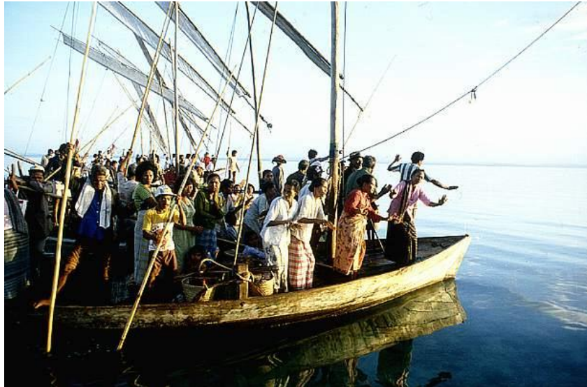
Singing and dancing, people from Sera Island (Tanimbar archipelago) set out to renew their alliance with a village on Yamdena Island, 1980.

Assuming the same positions as men on a ship – captain, jurumudi (in charge of steering), or jurubatu (responsible for the anchor) – they followed prescribed rituals until the boat returned (Drabbe 1940, pp. 47-51, 140-41). A more recent study by Susan McKinnon has recorded the persistence of many of these practices, including the ceremonial language and dance formations that celebrated the unity of a boat and its crew, and the “friendship voyages” by which intervillage alliances were renewed. Encoding the village as a perahu lying at anchor, she suggests, the stone boat imparted a sense of unity and stability to a people whose cultural memories were infused with legends of migration and resettlement (de Jonge and van Dijk, pp. 76-81; McKinnon 1988, pp. 165-66; 1991, pp. 68-83).