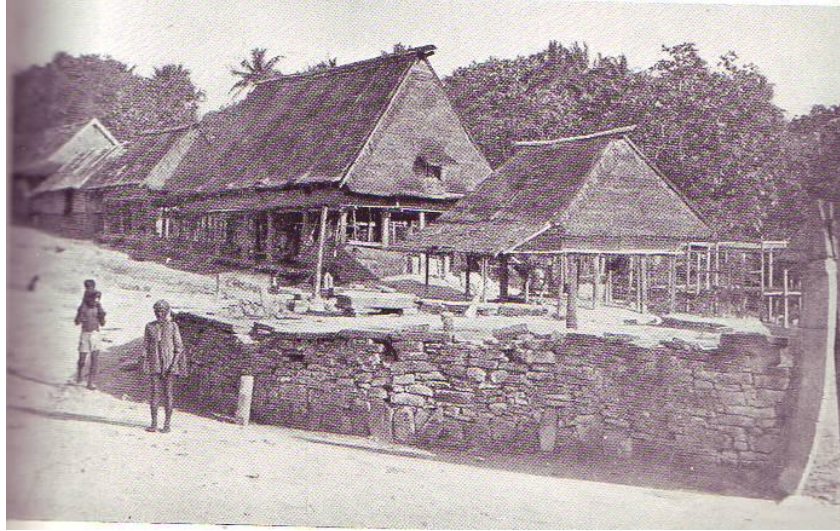
Boat-shaped stage, Tanimbar (from Drabbe, 1940).

Tanimbar women dance on a stage built in the form of a boat (from Drabbe, 1940)