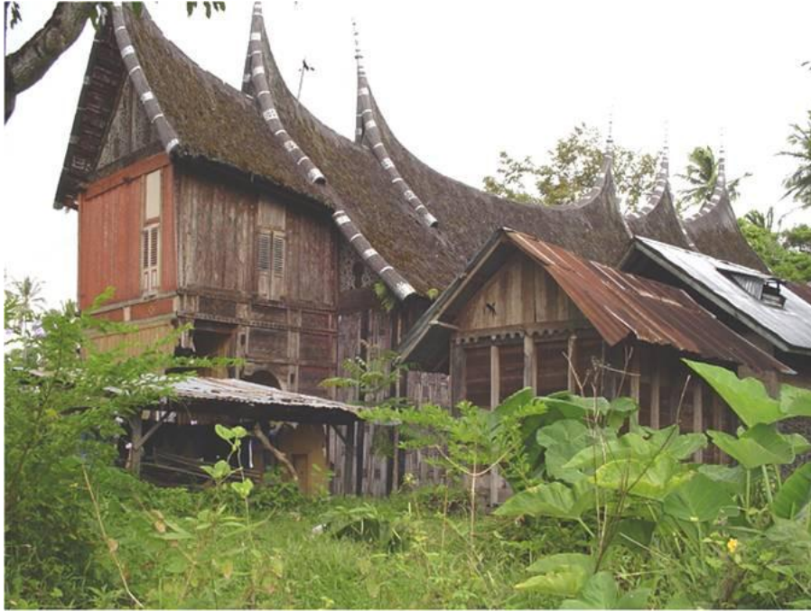
Minangkabau house near Bukittinggi, Sumatra, 2004.