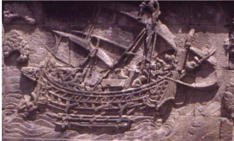
Relief from Borobudur, central Java.

interlocking relationship between land and ocean such a compelling teaching device. If we insist that the sea and those who live with the sea deserve a more prominent place in our study of Asia, we will take an important step in developing the framework required for any comparative overview. In turn, this framework will go a long way towards overcoming the confines of so-called area-studies while redressing the scholarly preoccupation with land-based societies that has so informed the presentation of Asian cultures.