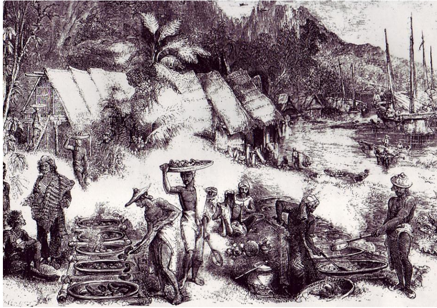
Makassar fishermen smoking teripang for the China trade, 1845. Port Essington, North Australia, (Macknight 1976, plate 11. Used with permission)