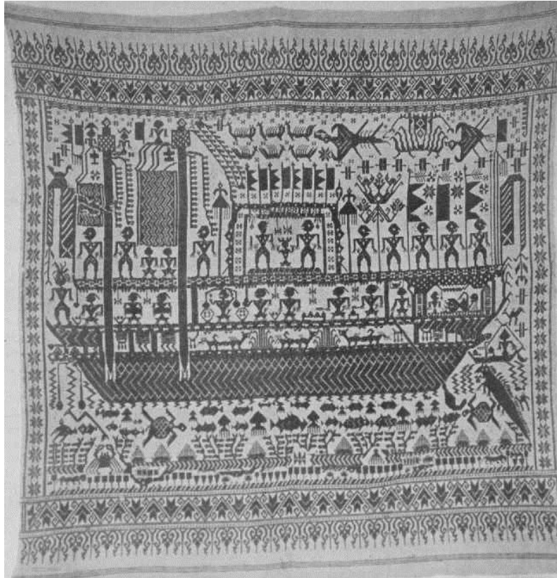
Example of a Lampung "ship-cloth."