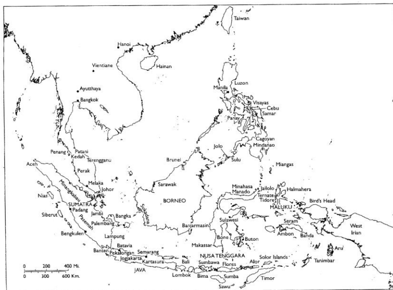
Island Southeast Asia

In responding to this comment, I turn to the island-rich environment of insular Southeast Asia, [5] and particularly to those areas of the Austronesian world where the symbolism of the sea and of boats is integral to political and social systems (Coedès 1968, pp. 3-4). The intimate relationship between land and sea so clearly articulated in these systems should encourage participants in larger conversations to think more seriously about the place of the oceans in Asian states traditionally characterized as agrarian. In a 1984 conference on Southeast Asia, Pierre-Yves Manguin (1986) spoke of “ship-shape societies” and the range and variety of references he assembled remains impressive. Although some scholars have cautioned against over-reading this symbolic language (Waterson 1990, pp. 20, 93), one cannot deny that the migration of ancient Austronesian-speaking peoples from southern China or Taiwan would have been by boat or that words connected with boating and sea travel are prevalent in linguistic reconstructions of proto-Austronesian vocabularies (Pawley and Pawley 1994, p. 329; Zorc 1994, pp. 543-45). More than three thousand years later, when the Spanish first reached the Philippines in 1521, boats were still the only means of long-distance transport, and there is no evidence of wheeled vehicles (Scott 1994, p. 5).