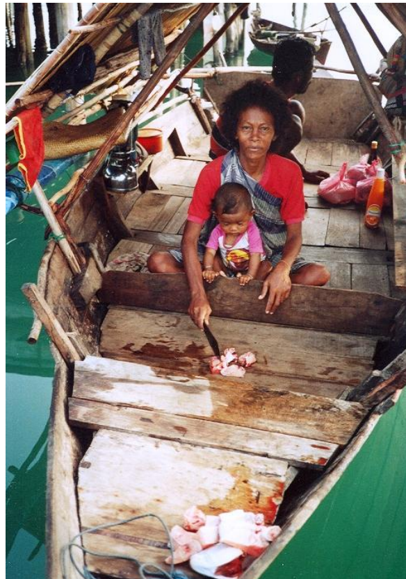
Orang Laut woman preparing food, Riau Archipelago 1991.