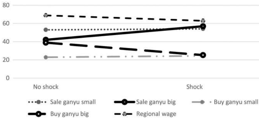
Figure 2. Ganyu buying and selling behavior of small and large farmers.

Since our main empirical focus is on ganyu labor, we are interested in identifying key covariates of ganyu labor over and above the village shocks. Table 1 highlights the prevalence of ganyu in Malawi and shows the characteristics of the households participating in the ganyu labor market. The first row shows that ganyu is a wide-spread phenomenon. During the year of the survey, more than half of the rural households in Malawi (44% + 9%) supplied some ganyu, and about one-quarter (16% + 9%) recruited ganyu. A noticeable 9% of the households even engage in both supply and demand of ganyu, which is also consistent with our model.