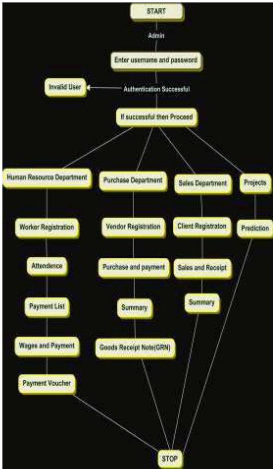
Fig 2. Flow chart