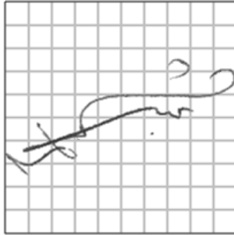
FIGURE 2: A virtual grid was placed on signature image.

In the proposed method for extracting features, a virtual grid is placed on the signature image that is shown in Figure 2. Then Gabor coefficients are computed on cross points of virtual grid in given rotation angles and wavelengths. These Gabor coefficients form the feature vector. The cross point of virtual grid is named as feature point.