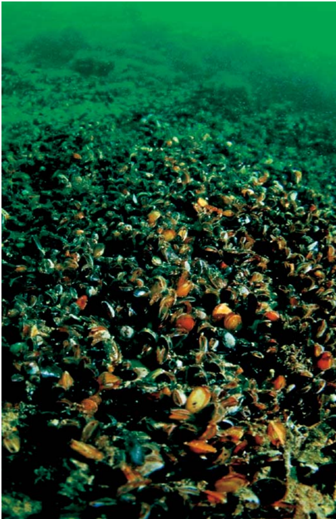
Figure 2. An example of reef effects. Blue mussels that have colonized a monopile at a wind power farm in the Strait of Kalmar, central Baltic Sea.

barnacles (24), mussels (25), and serpulid polychaetes (26). Biofilm is a problem for submerged infrastructure constructions because it induces metal corrosion and microbial-induced weathering of stone and cement (27).