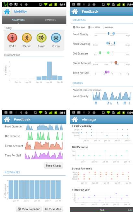
Figure 2. Snapshots of feedback graphics available in the ohmage Android application. Summaries and plots of general mobility states (still, walk, run, drive) captured from the continuous actigraphy trace (top left); graphic comparing baseline responses with responses from current week and past week self-report measures (top right); sparkline time-series and higher resolution time-series plots of various self-report measures (bottom left and right, respectively).

We will demonstrate the key features of the phone and server-side ohmage application. In addition, participants with Android phones will be invited to rapidly author and participate in their own campaigns. Data visualizations and feedback graphics will be available on participants' phones and on a website. Participants will be given usernames and passwords to provide secure access to their data. Data collection and graphics will be made available to participants for one month after the conference.