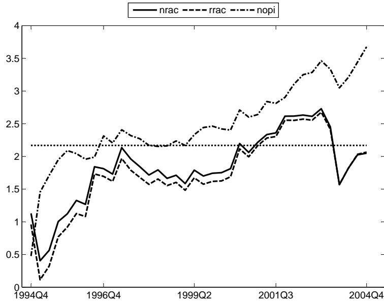
Figure 2: Giacomini and Rossi (2010) Fluctuation Test for Equal Out-of-Sample Predictability at h = 4