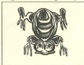
Figure 3: Frog Graphic