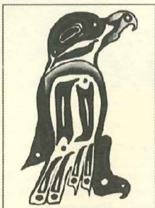
Figure 2: Eagle Graphic

In addition to class discussion and deliberation, the students created several documents to help coordinate decision-making. One document was a sign-up list by which students selected the content areas and technology areas on which they would work. Each student selected a primary technology area for which they would provide advice to other students and one or more secondary technology areas.