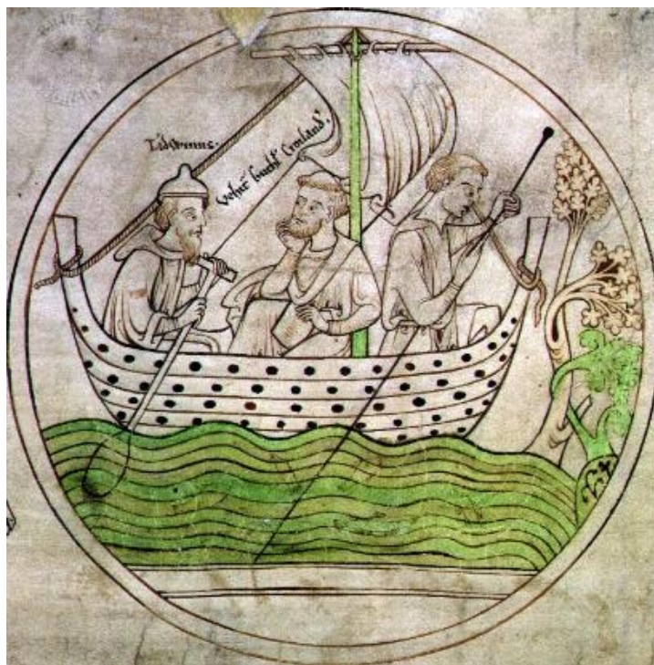
Figure 1: Guthlac and Tatwine travel by boat. From Harleian Guthlac Roll Y.6.