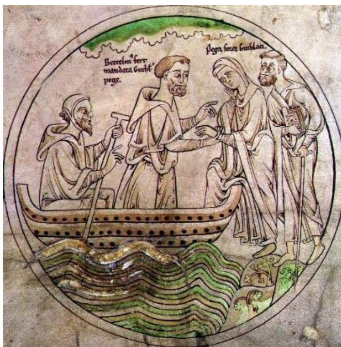
Figure 2: Guthlac and Pega. From Harleian Guthlac Roll Y.6.