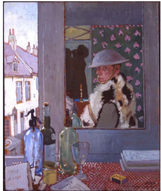
Sir William Orpen (1878-1931) Ready to Start. Self Portrait, 1917 Oil on panel. 608mm x 494mm