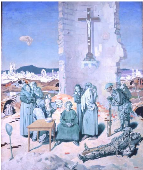
Plate n° 1

Sir William Orpen (1878-1931) The Mad Woman of Douai, 1918 Oil on canvas. 762mm x 914mm