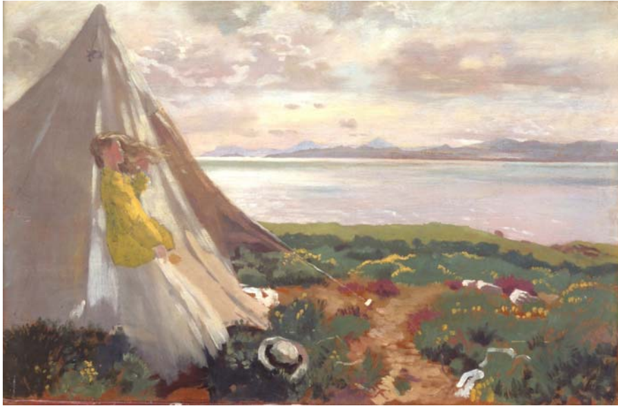
William Orpen (1878-1931) A Breezy Day, Howth Oil on panel (40 x 61 cm)