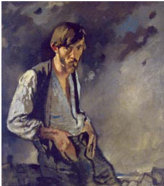
Sir William Orpen (RA,RI,HRHA) Man of the West (Seán Keating), Oil on linen, 107 x 97 cm