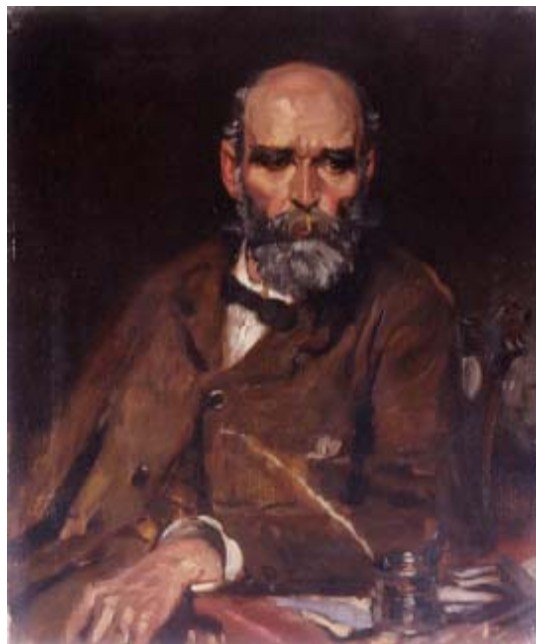
William Orpen (1878-1931) Michael Davitt, M.P. Oil on canvas (74.9 x 62.2 cm)