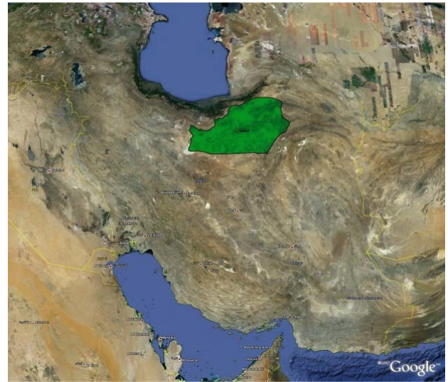
Figure 1. Semnan city

1381:18). Semnan is a dry and warm area which it's northern side ends to mountains and from south ends to Dasht-e-Kavir. Figure 1 shows the Semnan area.