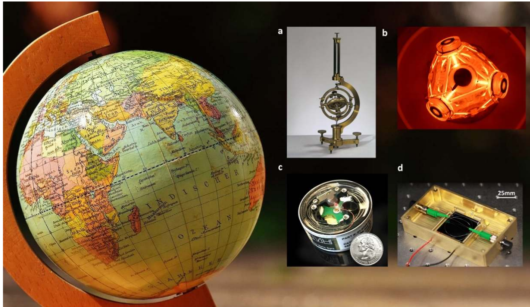
Figure 1 : Brief history of gyroscopes. a, the original spinning mass Foucault gyroscope (70cm height, 1852) [1]. b, the Helium:Neon ring laser gyroscope (33 cm, 1963) [4]. c, The interferometric fiber optic gyroscope (10 cm diameter, 1976) [5], the current miniaturized chip-scale Brillouin gyroscope (36 mm, 2020) [9].