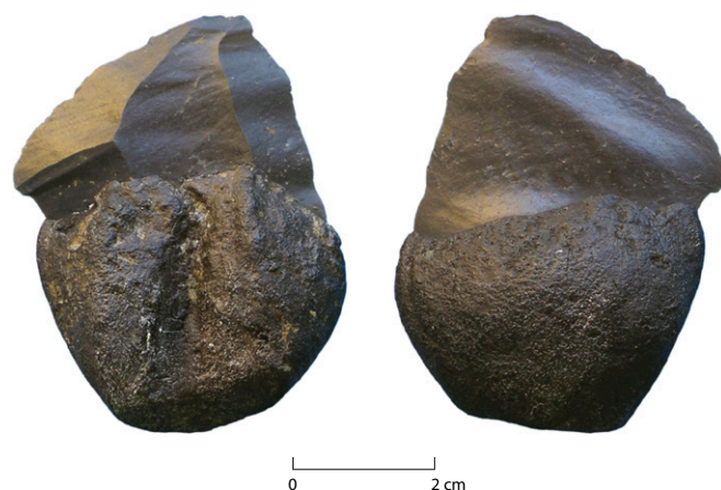
Fig. 1. Flint flake from Campitello Quarry (Italy), still enclosed in its adhesive, produced more than 200,000 y ago (42) ( SI Text ). Study of such adhesives (42, 43) showed that Neandertals used fire to synthesize from birch bark a pitch for hafting stone tools (photograph courtesy of P. P. A. Mazza, Dipartimento di Scienze della Terra, Università di Firenze, Florence, Italy).