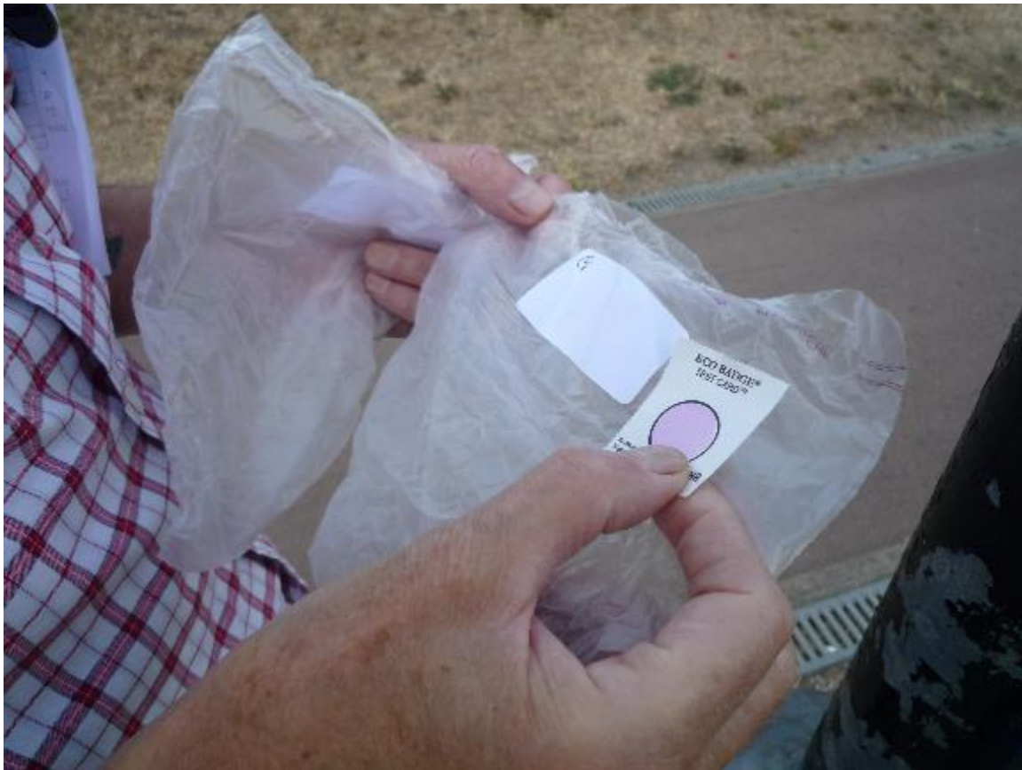
Figure 2 – Testing Eco-badge ozone detection kits on the Pepys Estate.

Activities commenced with a series of diffusion tubes being set out on lampposts around the area. Wipe samples were taken to assess the quantity and type of metals being deposited on vertical surfaces. Ozone levels were measured using Eco-badge™ ozone detection kits (see Figure 2), and leaf samples were collected and analysed by Lancaster University. All the data collected was analysed and compiled into a series of maps. A public meeting was held to provide feedback on the findings. As a result, the local authority (Lewisham) installed diffusion tube monitoring devices at the main junctions identified by the project as having higher levels of NO 2 . Levels of NO 2 in London are largely from vehicle exhausts and are also a strong indicator of the presence of other air pollutants derived from vehicle emissions. The council also installed a PM10 particulate monitoring station in the neighbourhood to monitor the local situation. Previously, the closest fixed monitoring station was just over a kilometre away.