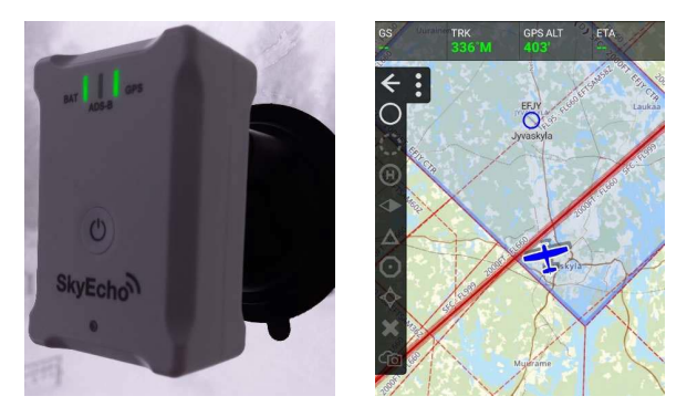
FIGURE 2. SkyEcho2 with OzRunways EFB application.

Compared to SSR, ADS-B is very handy and lightweight. With this simplified version of the air navigation technique, many manufacturers offer portable ADS-B transceivers. Some of these transceivers can fit in the plane's cockpit; some are hung on the window. They transmit and receive the ADS-B signals with a built-in antenna or via the aircraft's antenna port. EFB applications hosted on smartphones or tablets are connected to the transceiver device via WiFi. EFB application displays all the necessary navigation data to the pilot. These portable transceivers are programmable via computer or mobile application. A needed change in the static information (e.g., ICAO24 address, flight number, squawk code) can be done via the nominated program. In contrast,