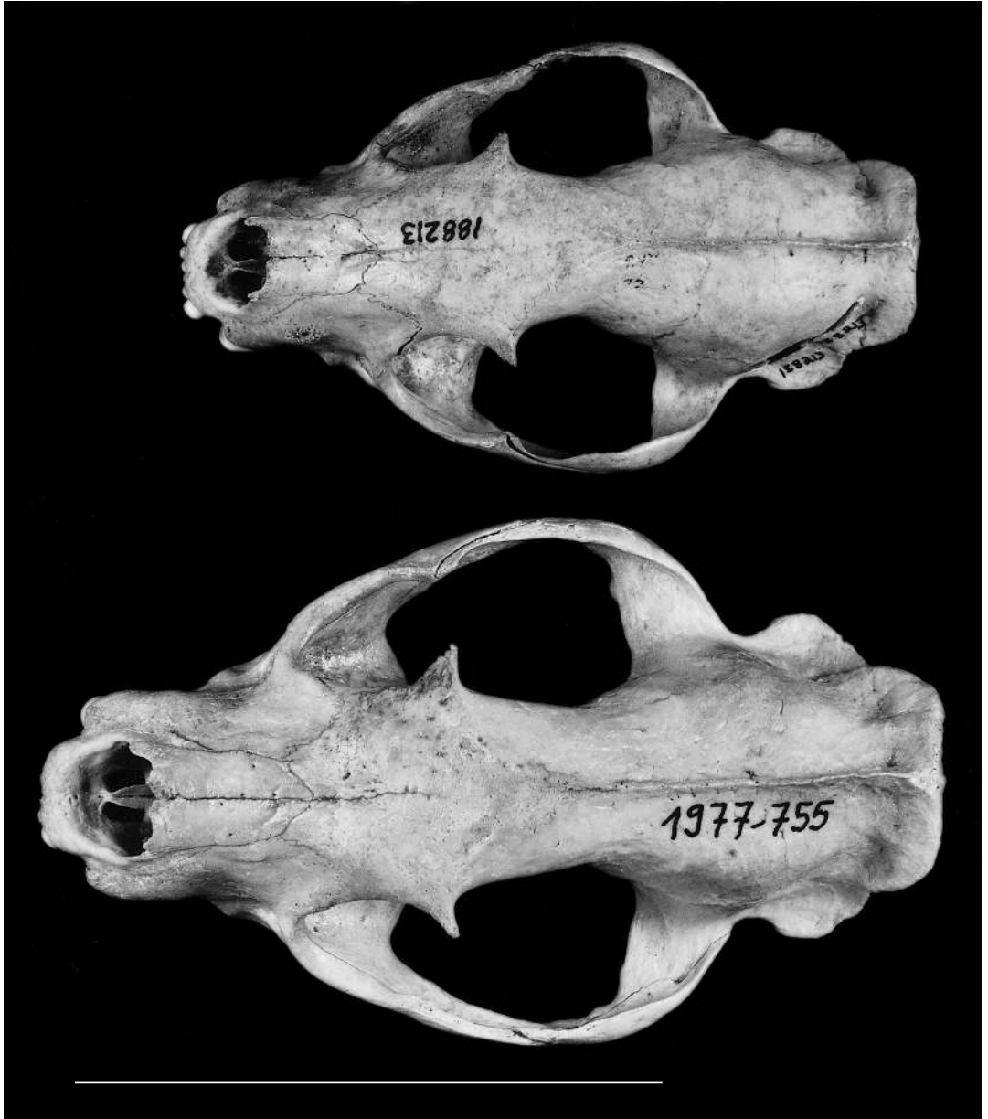
FIG. 3. — Dorsal views of the cranium of a recently collected Cryptoprocta ferox Bennett, 1833 (above) and the neotype subfossil C. spelea Grandidier, 1902 (MNHN 1977.755). The specimen of C. ferox (AMNH 188213) collected at Manakara in 1931 is amongst some of the larger modern individuals of this species measured during the course of this study. Scale bar: 10 cm.

Madagascar that may have been able to feed on lemurs of considerable size (Goodman 1994). However, this raptor would not have been able to predate on the adults of the larger extinct lemur