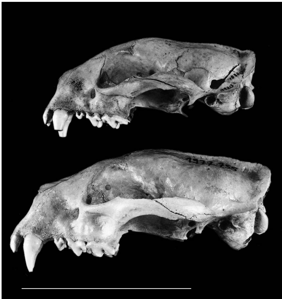
FIG. 5. — Lateral views of the cranium of a recently collected Cryptoprocta ferox Bennett, 1833 (above) and the neotype subfossil C. spelea Grandidier, 1902 (MNHN 1977.755). The specimen of C. ferox (AMNH 188213) collected at Manakara in 1931 is amongst some of the larger modern individuals of this species measured during the course of this study. Scale bar: 10 cm.

C. ferox or their carcasses scavenged. Adults of many of the subfossil lemurs would presumably have been in the range of prey size of the more massive predator C. spelea and since its presumed extinction there may have been considerable changes in predator pressures on the island's larger land vertebrates.