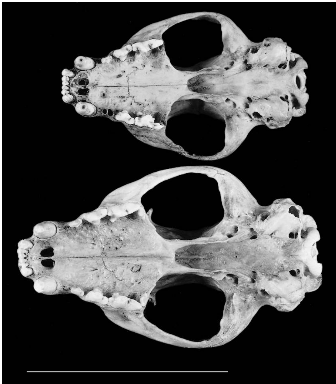
FIG. 4. — Ventral views of the cranium of a recently collected Cryptoprocta ferox Bennett, 1833 (above) and the neotype subfossil C. spelea Grandidier, 1902 (MNHN 1977.755). The specimen of C. ferox (AMNH 188213) collected at Manakara in 1931 is amongst some of the larger modern individuals of this species measured during the course of this study. Scale bar: 10 cm.

capable of taking larger prey than the extant C. ferox . This later species is known to physically take animals up to slightly more than 6 kg. Larger prey, such as the bush-pig ( Potamochoerus larvatus