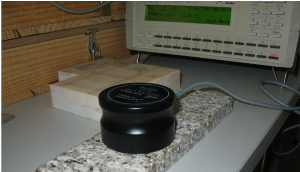
Figure 2 -Heat Tranfer Analyser ISOMET 2104. The measuring probe is the black device on top of the rock sample.