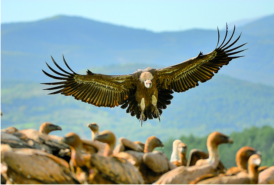
Griffon Vultures at a feeding station in Lleida, Spain.