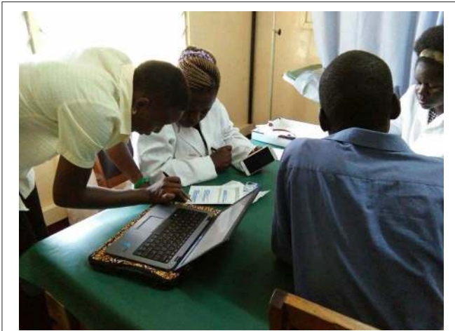
FIGURE 6 | Public engagement sessions consisting of discussions with individual stakeholders at the sentinel hospitals. Consent has been obtained from all participants identifiable in the photos.

beyond research-focussed activities to one integrated in the national surveillance system.