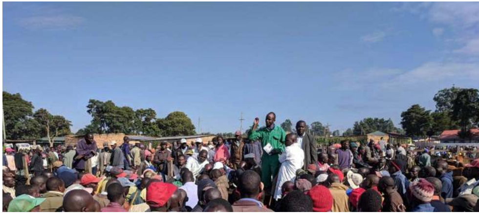
FIGURE 3 | Public engagement sessions consisting of public addresses and distribution of pamphlets at sentinel livestock markets. Consent has been obtained from all participants identifiable in the photos.