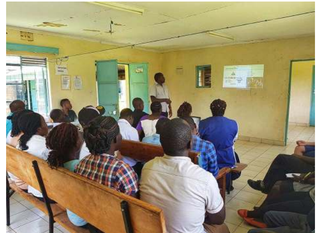
FIGURE 5 | Public engagement sessions consisting of presentations during organized CME sessions at sentinel hospitals. Consent has been obtained from all participants identifiable in the photos.

changes in the amount and distribution of circulating pathogens over time.