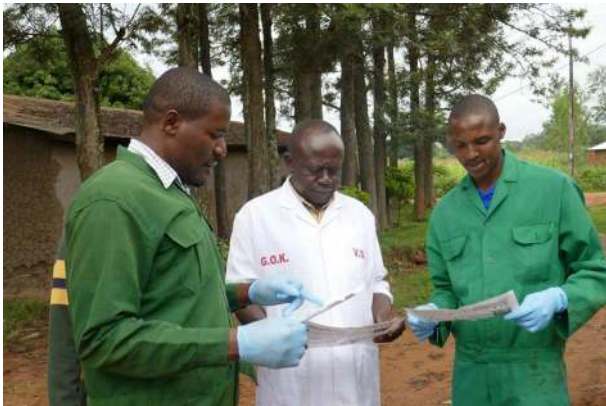
FIGURE 4 | Public engagement sessions consisting of discussions with the meat inspector and slaughterhouse workers at sentinel slaughterhouses and slabs. Consent has been obtained from all participants identifiable in the photos.