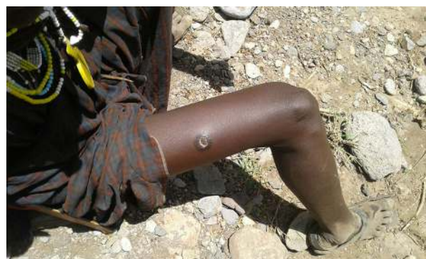
Photo 4. Cutaneous anthrax in a resident of the Ngorongoro Conservation Area where anthrax is an endemic disease with seasonal peaks in wildlife, livestock, and human case numbers.