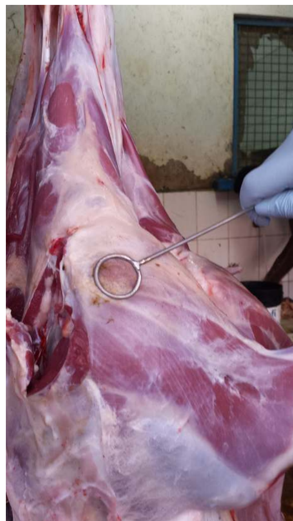
Photo 3. Staff training in standardized methodology for carcass swabbing to support slaughterhouse-based surveillance of meat borne pathogens such as non-typhoidal Salmonella and Campylobacter species. Moshi, Tanzania.

Serological tests cannot differentiate between infections caused by B. abortus , B. melitensis , or other Brucella species. Because different Brucella species have distinct transmission dynamics and control options, it is important to determine the identity of Brucella in patients with fevers and in potential reservoir host species. Achieving this requires access to the