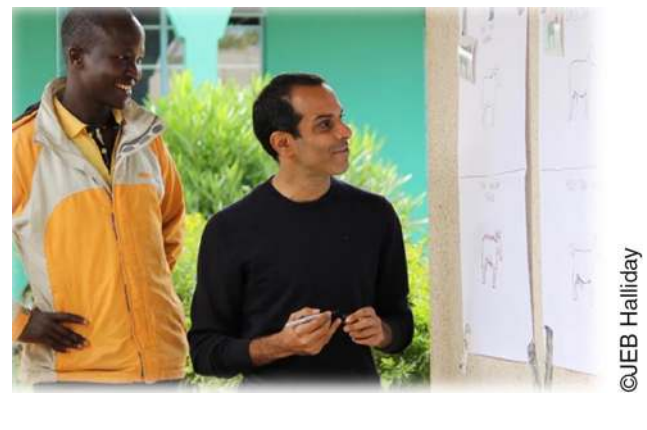
Photo 1. Development of bespoke cartoons in consultation with Tanzanian end-users to create culturally appropriate communication tools for One Health research.

genuinely understood the research goals, nor had they had time to reflect on whether or not to take part in the study. This is not a new problem in development research. The standard consent process of a single meeting between investigator and volunteer may be insufficient for adequate comprehension of informed consent. 22 Indeed, Sreenivasan argues that full comprehension is rarely achieved in research and should be considered an ethical aspiration rather than a minimum standard, 23 claiming that if full comprehension was a necessary condition of valid consent then much scientific endeavour would be impossible. To protect prospective research participants, their level of understanding can be assessed prior to consenting. Cooper and colleagues used comprehension and engagement scores to test the effectiveness of 3 communication tools—written documents, illustrative photographs, and illustrative cartoons—when providing study information to 22 Tanzanian livestock keepers prior to consent. 21 Cartoons were associated with significantly higher engagement scores, highlighting the usefulness of alternative means of information provision.