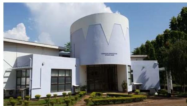
Photo 2. Kilimanjaro Clinical Research Institute, Moshi, Tanzania (top), and the welcome sign to the bespoke Zoonoses lab set up within KCRI to enable One Health research (bottom).

An unintended consequence of the separation of laboratories and staff processing human and animal samples is lack of communication. For example, our research team was involved in anthrax diagnostics on animal-derived material and was not aware of the availability of molecular diagnostics for anthrax in human samples in an adjacent laboratory until a discussion about diagnostics was sparked by the occurrence of human anthrax in northern