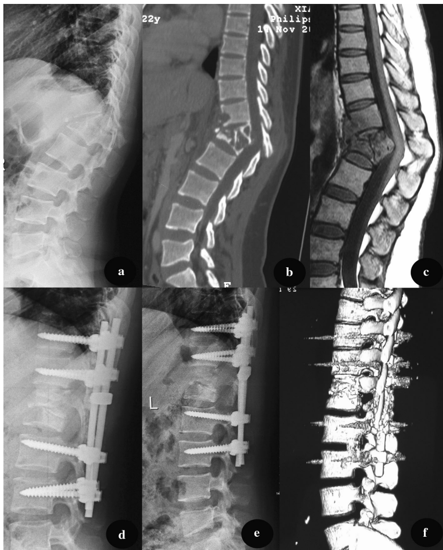
Fig. 2 A pre-operative X-ray of a 45-year-old male demonstrated the destruction of T12 and L1, with a kyphosis angle of 43°. CT and MRI (b, c) show vertebral bone destruction and paravertebral abscess formation, severed spinal cord compression. The patient underwent one-staged anterior debridement, autologous bone grafting and

posterior instrumentation. d A lateral X-ray indicates that kyphosis was corrected to 6° 3 months after surgery. e, f At 18-month follow-up, fixation was in good shape, without signs of tuberculosis recurrence