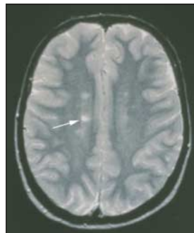
COM-UNIQUESTOWN MEDICAL STOCKPH

EDITOR—Chitty et al suggest a strategy to identify chromosomal abnormalities that relies on quantitative fluorescent polymerase chain reaction (qf-PCR) and full karyotyping only in cases of fetal nuchal translucency thickness > 4 mm, as opposed to full karyotyping of all chorionic villous samples. 1 Eliminating double testing results in an upfront economic savings of about £1.5m (£2.17m; $2.50m) distributed across 17 479 pregnancies. However, such an