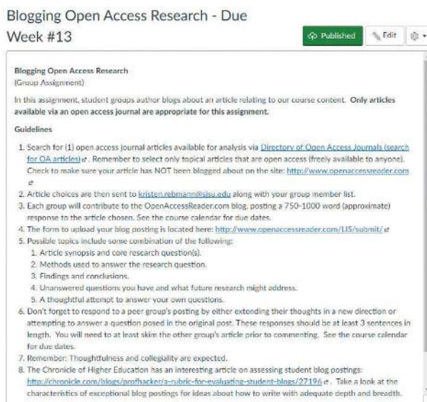
Figure 2: Blogging assignment prompt

Each group contributed a collaboratively-authored 750-1000 word (approximate) response to the article chosen. Quite a bit of structure was provided to students in terms of possible topics and content to include in their postings. Suggested content included a request that postings contain some combination of the following: