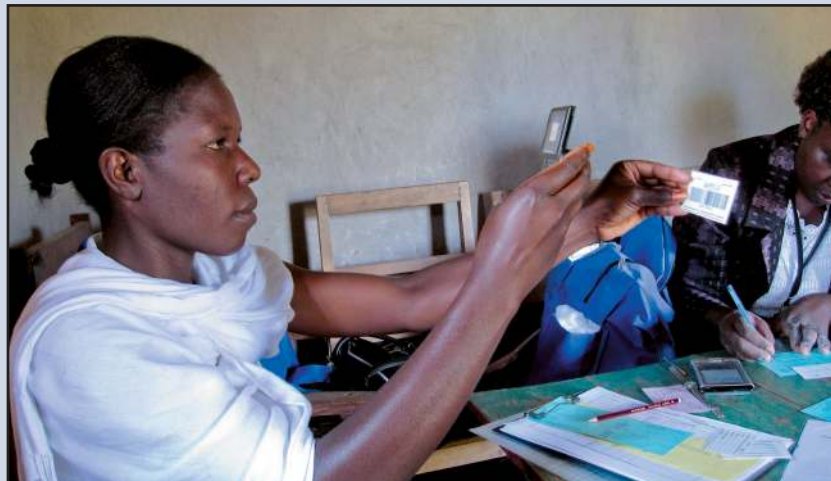
Figure 2. An HCT counselor scans a patient's demographic information into ODK Collect.

Over the next two years, HCT counselors will use 300 Android phones equipped with ODK Collect to reach millions of people in Western Kenya. They will be free to customize and extend ODK as they