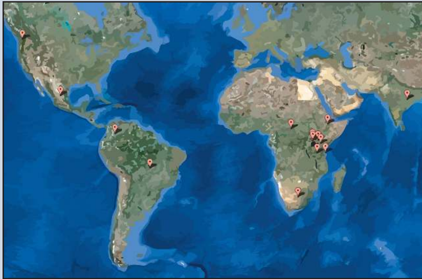
Figure 1. Examples of ODK deployments include deforestation monitoring in the Amazon, decision support for pediatrics patients in Tanzania, documenting war crimes in the Central African Republic, and monitoring school attendance in India.