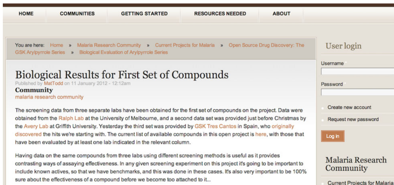
Fig. 4. The Synaptic Leap, a coordination site allowing project discussion and updates.

in this way has a democratising or levelling effect that undercuts the traditional academic monikers—thus for example in comments under a post in the malaria project (Fig. 4) ( http://www.thesynapticleap.org/node/367 ) an undergraduate student and a professor who had never met were able to discuss openly a point of theory about the data without it ever mattering who was who.