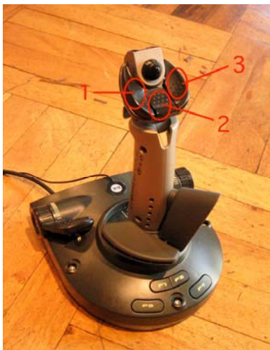
Figure 3: The Saitek Cyborg 3D joystick has 13 buttons and 4 continuous controllers. The three buttons on the top, labeled 1 to 3, can be used to route the continuous controller values to different destinations.

Finally, we promote the use of OSC for designing controller data streams that are modal . For example, the Saitek Cyborg 3D joystick provides an extremely flexible controller due to the number of buttons it has accessible to the performer in conjunction with its 4 continuous controllers (figure 3).