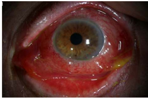
Figure 3 Hyaluronidase allergy: conjunctival injection and chemosis.

In 2012, Dieleman et al reported a cluster of 44 Dutch patients presenting with orbital inflammatory signs and symptoms after uneventful ophthalmic surgery. 72 On investigation, it was discovered that in all cases, 150–300 IU mL -1 HA had been added to the anesthetic mixture. Skin patch