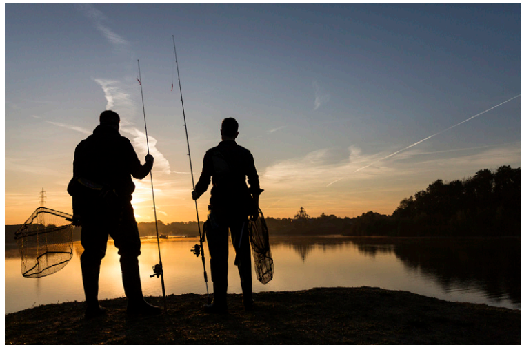
For too long, the considerable importance and impacts of recreational fisheries have been ignored.

Although commercial capture fisheries globally harvest about 8 times the fish biomass caught by recreational fisheries (4), in many localities recreational landings now rival or even exceed the biomass removals by commercial fisheries. In inland waters in the temperate zone, recreational anglers are now the predominant users of wild fish stocks (5), and recreational fishers have become prevalent in many coastal and marine fisheries (6, 7). Globally, recreational fishers catch about 47 billion individual fish per year, of which more than half are released alive (4), either because of harvest regulations or in response to personal ethics (8). Despite high release rates, fishing for food is a