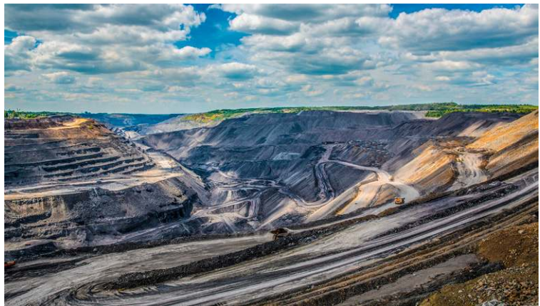
Mining is one example of the human impact on geodiversity. Active mines cause a decrease in local biodiversity, but in some cases they can provide an important habitat for specialized and rare species after the mine has been abandoned.

Although the current essential variables frameworks account for the biosphere, atmosphere, and some aspects of the hydrosphere (1–4), they largely overlook geodiversity—the variety of abiotic features