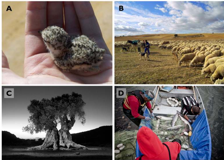
Fig. 2. Examples of relational values. (A) A young water bird ( Charadrius sp.) in a human hand illustrates stewardship of nature. In the parlance of relational values, regardless of a thing's current state, what matters most is humans' responsibilities, which stem from our relationships with that thing. (B) Transhumant shepherds and sheep dogs on their annual migration on the Iberian Peninsula. The relationship goes beyond management for human benefit, reinforcing cultural identity through active ritual care. (C) Ancient olive tree on Aigina Island, Greece, 1,500–2,000 years old. The tree is no longer harvested but has great symbolic significance for island people. (D) Salmon fishing on the west coast of North America is particularly rich in relational values due to benefits and values such as sustenance, identity, and strengthening of social ties.

into the instrumental framing of ecosystem services because they are inherently relational: cultural services are valued in the context of desired and actual relationships (Fig. 1).