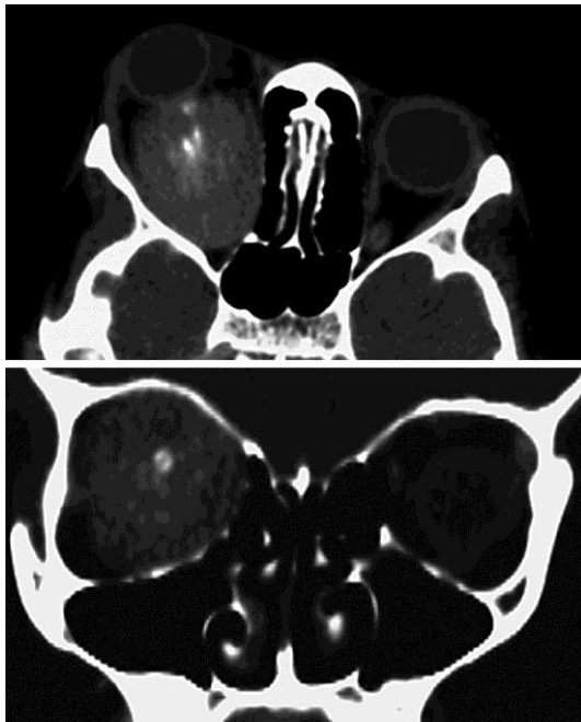
Fig. 1. CT scan of an ONSM in an 8-year-old patient. Pre-contrast axial cut (above) and post-contrast coronal cut (below) showing an intraconal well-defined lesion with several patches of linear calcification surrounding the optic nerve.

The authors have no conflict of interest related to this paper.