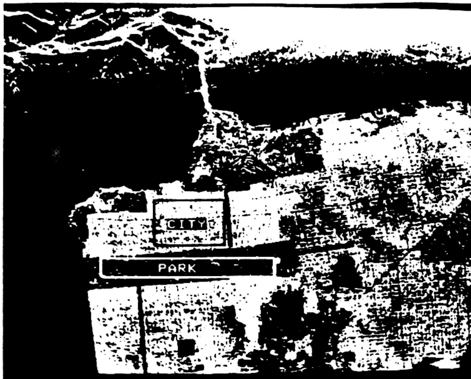
Figure 2 Training areas used to generate the covariance matrix elements for the park and urban (city) regions, shown in table 1.