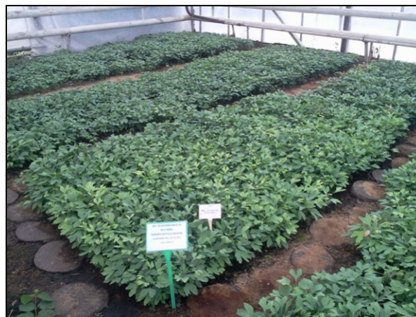
Fig. 1. General view of G. biloba plantation in SNAU

The experiment on G. biloba cultivation was founded in 2014 in three variants: Variant No 1: G. biloba growing in a greenhouse at 60–80% humidity and temperatures not below +27 °C; shading (shading level 60%) by green agronetting. Variant No 2: growing in open ground; shading (shading level 60%) by green agronetting; climatic conditions typical for the Sumy region. Variant No 3: growing in open soil; there is no shading; climatic conditions typical for the Sumy region. The general view of the plantation G. biloba (variant No 3) is presented in Figure 1.