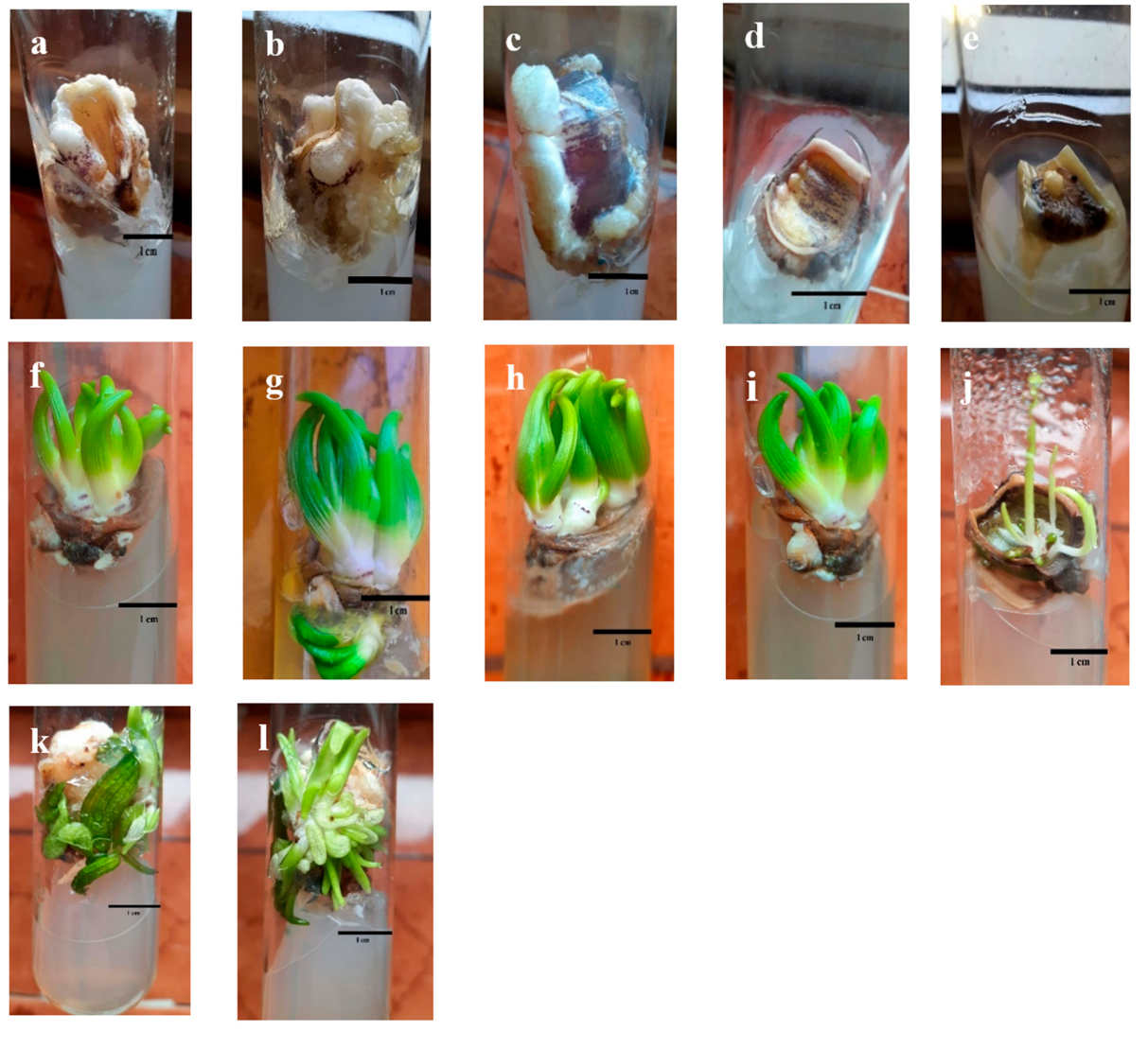
Figure 2. Morphogenesis induction on MS basal media supplemented with 1.5 mg/L IAA + 1.0 mg/L BA, cultivars: (a) Pink Pearl, (b) Jan Bos, (c) Blue Pearl, and (d) Serene Blue, and at 1.5 mg/L IAA + 3.0 mg/L BA cultivar: (e) White pearl. Shoot regeneration on MS basal media supplemented with 1.0 mg/L IAA and 2.0 mg/L BA (f) Pink Pearl, (g) Jan Bos, (h) Blue Pearl, (i) Serene Blue, and (j) White Pearl. The bottom pictures show the vitrification and deformed leaves and growth in the Pink Pearl cultivar (k) and White Pearl (I) at 1.0 and 2.0 mg/L BA respectively.

The chlorophyll content increased with the increasing BA concentration in all cultivars (Figure 1f,g). The blue flowered cultivars (Serene Blue and Blue Pearl) had the highest chlorophyll a and b concentration, followed by the red and pink cultivars (Pink Pearl and Jan Bos). The lowest chlorophyll content was detected in the White Pearl cultivar. Vitrification and deformed leaves and growth appeared in the Pink Pearl and White Pearl cultivars at 1.0 and 2.0 mg/L BA, respectively (Figure 2k,l).